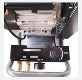
Filter regulator and hand bar panel For easy control. Only for single-phase compressors.

On all 15-hp units for optimal installation.